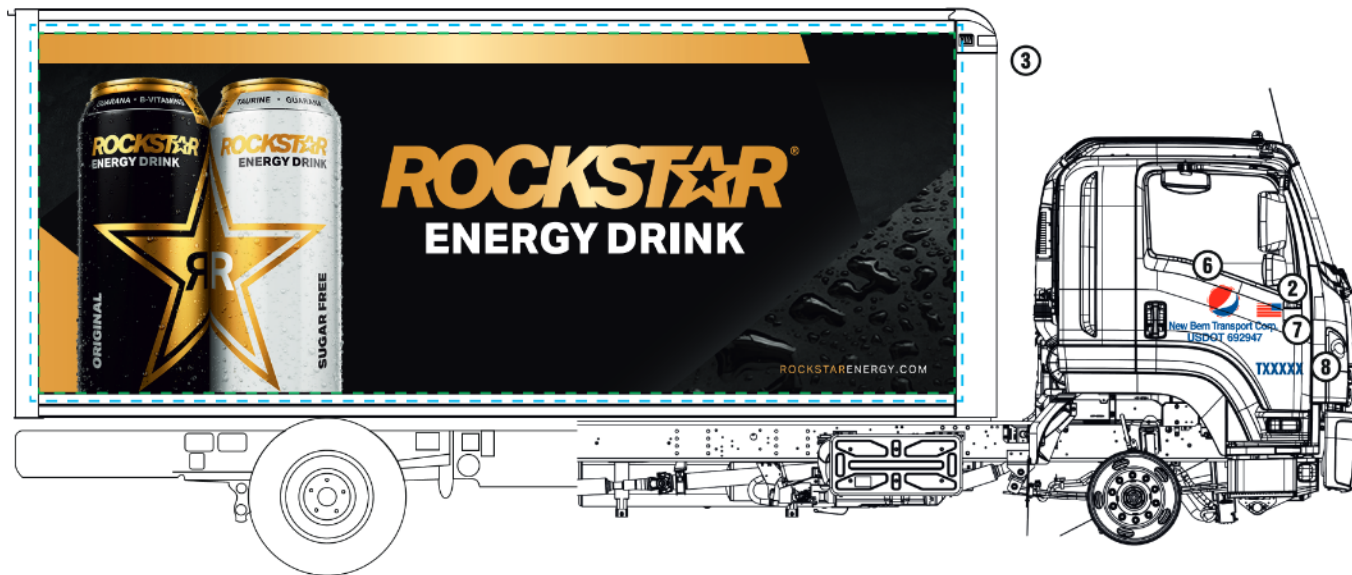
(*shown larger than scale)