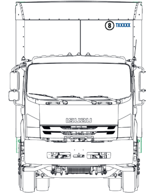
(*shown larger than scale)