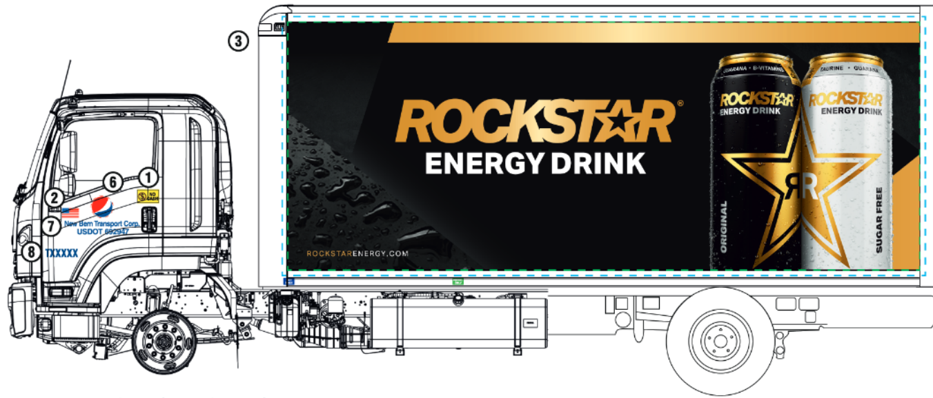
(*shown larger than scale)

Please Note: Art layouts are 2D representations of 3D vehicles. Due to compound curves of 3D vehicles, the actual finished look may be different. Some adjustments will occur at the time of application. Industry standards for applications include not applying vinyl behind bumpers, recesses of door handles, or on rubber moldings. Relief cuts may be required depending on size of recess.