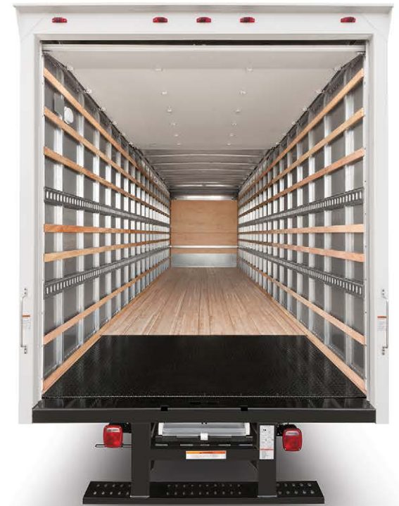
Cargo Interior - E-track and Tie Slats