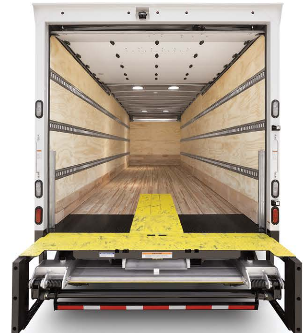
Cargo Interior - Plywood and E-track, Sky-Lights in Roof