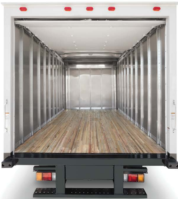
Cargo Interior - Standard