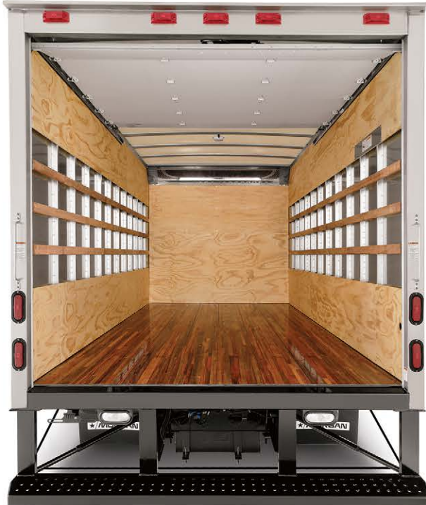
Cargo Interior - Plywood and Tie Slats, Floor Varnish